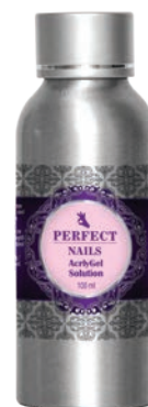
AcrylGel Solution | PNZ4057

We strongly recommend to protect your brushes by using AcrylGel Solution.